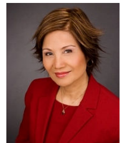
Area 21 Governor Evelyn Ybarzabal